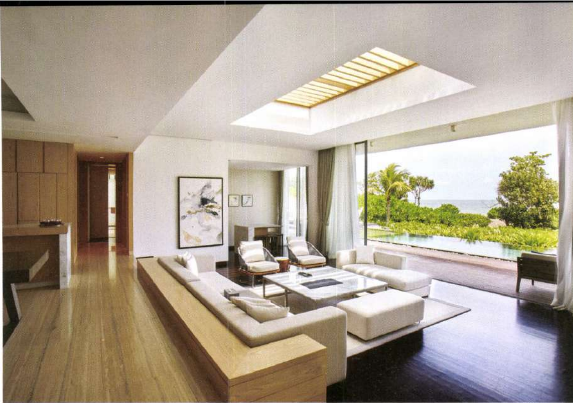
Natural light fills the entirety of the elegant villas

To have a home with a swimming pool is already a great luxury, but a life lived by the sea—that is a higher plane altogether.